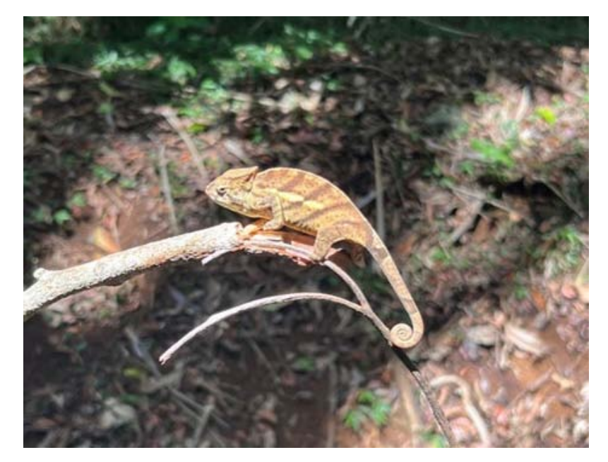
Amber Mountain National Park, Joffreville, Madagascar. Pictured: Chameleon